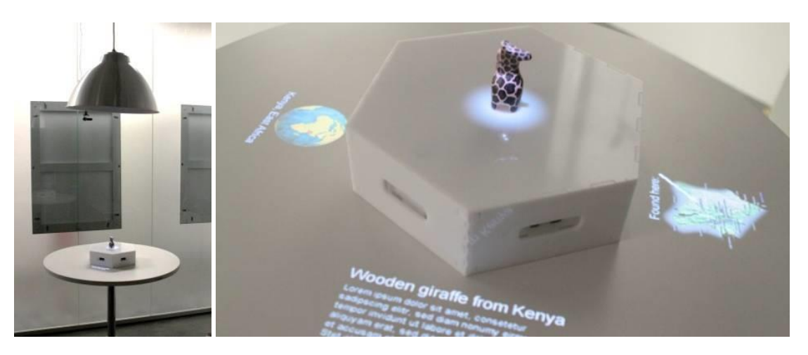
Figure 1: Plinth prototype designed in a participatory design workshop with cultural heritage professionals that senses visitors around an exhibit and projects content according their position

To demonstrate possible applications of the meSch platform several prototypes have been developed, e.g.: