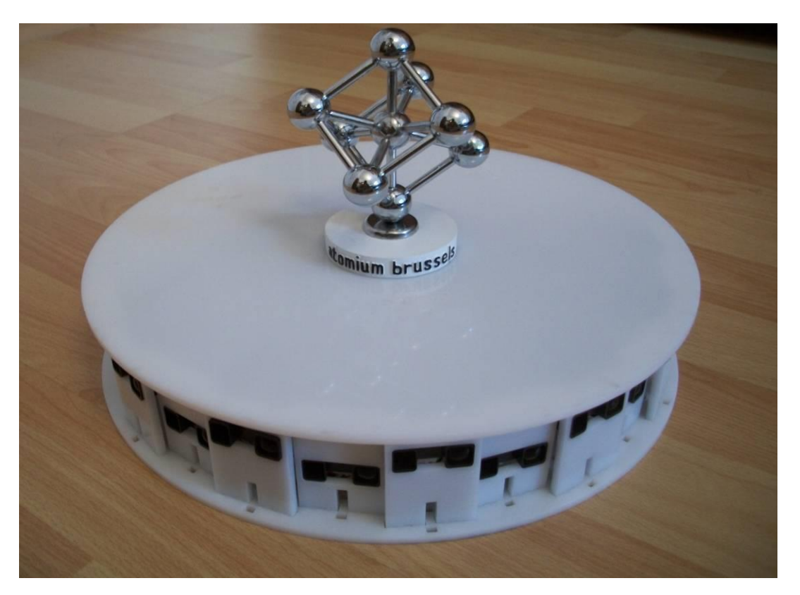
Figure 6: Improved Plinth design using 24 IR sensors to avoid blind spots in sensing proxemics interactions around the Plinth