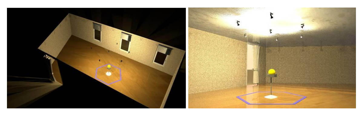
Figure 3: Exhibition room with art piece (illuminated 3D brain) placed on the Plinth

To have external validation in the evaluation of the Plinth, we installed a second sensor, a 180 degree wide angle surveillance camera, on the ceiling above the Plinth. That allowed us to capture visitors' movements in the exhibition, too.