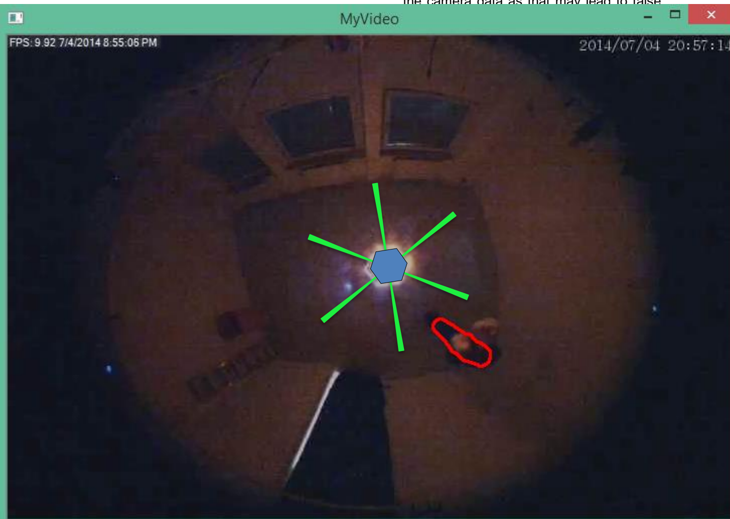
standing within the Plinth's IR sensor range (that are 6 times 15 degrees)

Filtering abrupt noise in the Plinth data, which did not refer to a person shown in the camera data as that may lead to false