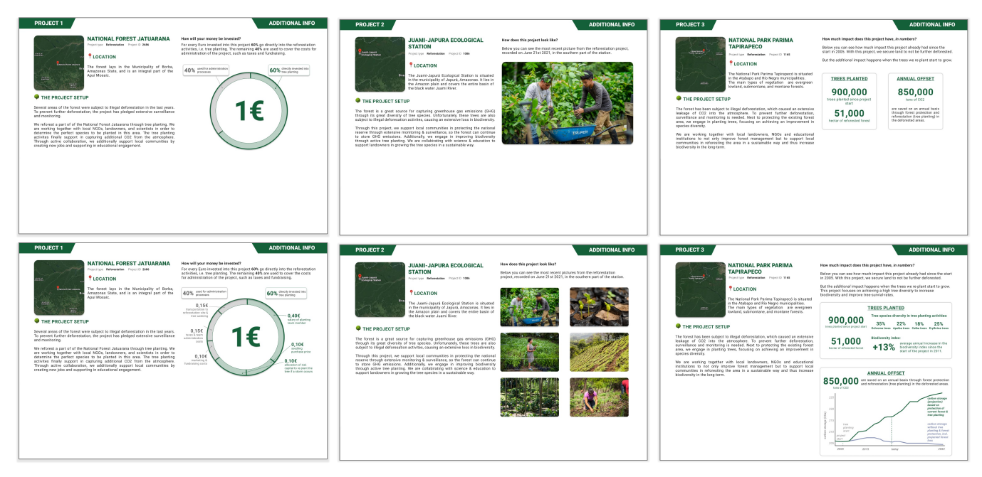
Figure 2: The prototyped interfaces. Each interface shows a general text-based project description on the left side and additional data on the right side. The additional data operationalizes the independent variables, namely the type of data and the level of detail at which it is presented. The first column from the left shows financial data, the second one images, and the third one forest data. The first line shows the low level of detail and the second line shows the high level of detail. High resolution images are in the supplementary material.

by McKnight et al. [58]. To acknowledge the multi-dimensionality of trust, the averaged scores of the three questions represented the final trust value index.