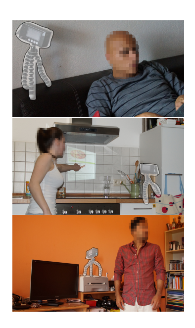
Figure 3: Users building and explaining their setups