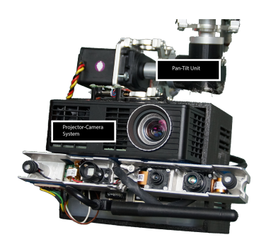
Figure 1: The UbiBeam System a Compact and Steerable Projector-Camera System