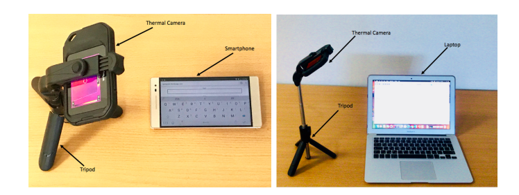
Fig. 1. The thermal images collection setup showing the input device, and the thermal camera placed on a tripod placed 30 cm away from the device.

Participants , Apparatus , and Setup We recruited 25 participants (16 males, 9 females) using a mailing list. Their ages varied between 18 to 23 (M=21.32, SD=1.14). Only one participant was left-handed and none of the participants had experience with thermal cameras. We used a Flir C2 Camera [2] thermal camera with resolution (80 px × 60 px). The camera was mounted on a 25 cm high tripod placed 30 cm away from the device (see Figure 1). Input was provided on a Lenovo Tango Phab 2 Pro smartphone with a gorilla glass screen (1440 px × 2560 px) pixels, and a MacBook Air Laptop (1440 px × 900 px).